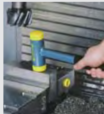
The face is made of medium-hard polyurethane for full blows and protects delicate surfaces and edges.

Wiha has now put an end to the familiar problems associated with the stress on joints and muscles when working with recoiling hammers. The Wiha dead-blow hammer has a special filling in the hammer casing to prevent recoil. Professionals who use these hammers on a continuous basis, for example, in tool and die shops or in body maintenance and sheet-metal work, appreciate the benefits of this recoilless hammer from Wiha.